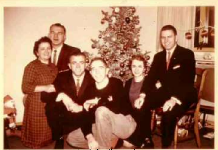
ee's family growing up